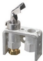
UNIVERSAL PILOT BURNERS Q314U/Q345U/Q348U/Q3451U

The S8610U offers replacement compatibility of more than 400 Resideo and other models. This control works in both single- or dual-rod systems and features field-selectable prepurge and ignition trial timings.