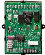
UNIVERSAL ELECTRONIC FAN TIMER ST9120U1011

The ST9120U Universal Electronic Fan Timer replaces most previous Resideo fan timers. It's the only one you need. LED diagnostics and continuous EAC and HUM terminal connections save you time and money.