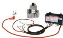
UNIVERSAL INTERMITTENT PILOT RETROFIT KIT Y8610U6006

This universal product offers wide-capacity control for almost any IP, HSI or DSI gas-fired appliances.