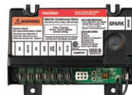
UNIVERSAL INTERMITTENT PILOT IGNITION MODULE S8610U3009

The Q340 family of thermocouples generate 30 mV in standing pilot applications, providing enough energy to power a gas valve. They are designed for long life and durability.