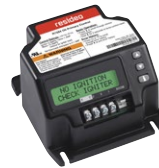
UNIVERSAL ELECTRONIC DIGITAL OIL PRIMARY R7284U1004

Every day more distributors and contractors recognize the advantages of universal replacement. Instead of having to stock and travel with a vast assortment of products to manage like-for-like replacements, you can invest in a time-saving series of products from a trusted name in the industry. That means always having the part you need for your customer, without extra service trips or overstocked shelves. The right part from the right company — Resideo, the leader in universal replacement parts.