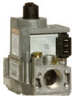
UNIVERSAL STANDING PILOT GAS VALVE VR8300M4406

Our S9200U Universal Integrated Furnace Controls replace more than 195 single-stage hot surface ignition furnace controls, offering universal application and robust diagnostics.