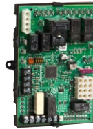
UNIVERSAL INTEGRATED FURNACE CONTROL S9200U1000

The ST9120U Universal Electronic Fan Timer replaces most previous Resideo fan timers. It's the only one you need. LED diagnostics and continuous EAC and HUM terminal connections save you time and money.