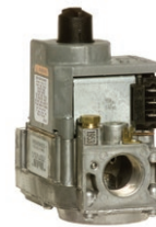
ELECTRONIC IGNITION GAS VALVE VR8345M/Q/K

This universal standing pilot gas valve replaces hundreds of gas valves in 24 Vac, gas-fired applications.