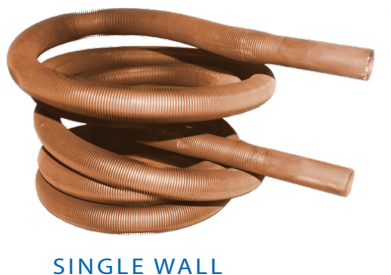
This heat exchanger provides a higher BTU output per foot than any other heat exchanger in the market.