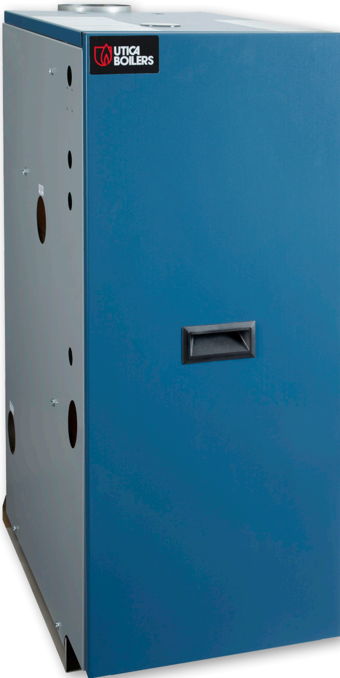
Dry Leg Casting